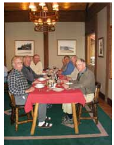
Food was outstanding