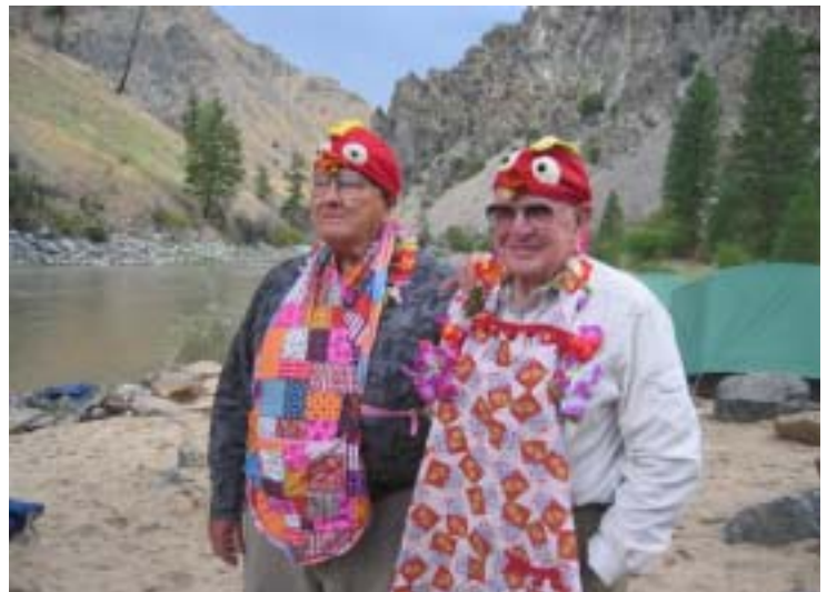
Two of our esteemed members on dress-up night near the end of a long float trip.